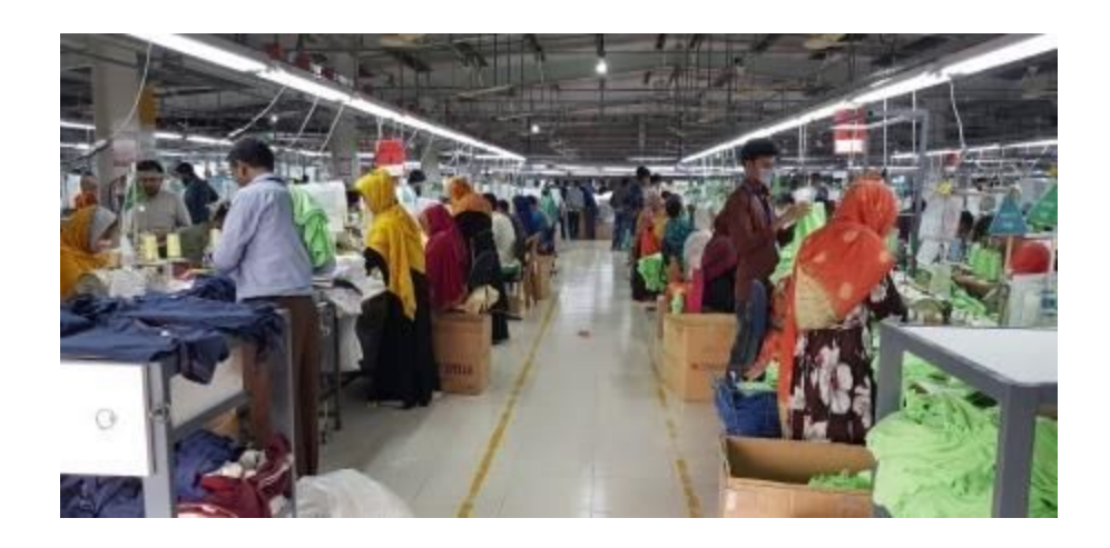
Inside a garment factory.

I still work for the same garment factory. Nowadays, my health is absolutely fine and my body is in great condition again. However, as for my state of mind... Well... that frightening experience has had a big effect on the kind of person I am now. I have become a much more inward looking and quieter person compared to how social and open I was before. And now, I am really careful to notice everything taking place around me.