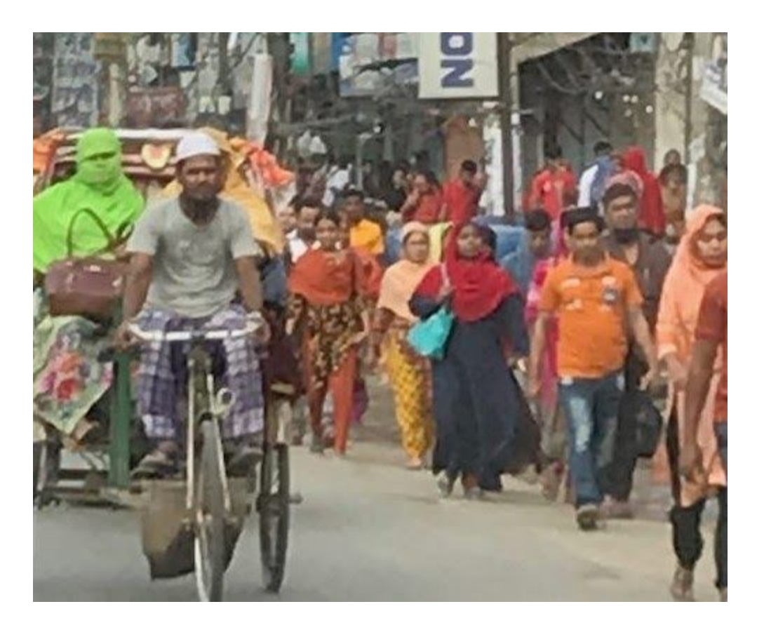
People on their way to work.

When I worked in the garment factory, I used to work every night until early morning. I worked from 8 pm in the evening till 5 am the next day. I was used to working at this time because I was able to catch up on sleep later. I went to the factory around 7:45 pm every evening, fifteen minutes before I had to start working. I reached the factory just as the clock hit 8 pm and I started working as soon as I arrived. I had to pack the garments into boxes and take them to the delivery truck* so that they could be sent all over the world. Yes, people from richer countries all around the world like to buy the clothes we make, so cheaply , in Bangladesh.